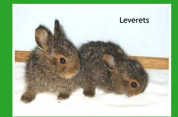
Notes on Lepus americanus washingtonii: A member of the family Leporidae ("rabbits and hares. Little is known about this subspecies biology and much is inferred from the species in other areas of BC. Genetic research indicates that L. a. washingtonii appears to form part of a Pacific Northwest group distinct from other hare populations.

Length 39-58 cm. Unlike other populations in BC and North America, the washingtonii subspecies does not Description undergo a characteristic seasonal colour morph to white in the winter. The head, back and upper parts of the legs are covered in short, brown to cinnamon pelage (fur) with somewhat coarser, white tipped outer hairs on the back and sides. The tips of the toes, chest, belly, chin and insides of the legs have varying patches of white. The outer margins of the ears are lined with black and white. The hind feet (from which the species derives its name) are distinctively large and have thick fur on the undersides instead of bare toe pads. Hind foot length averages >11cm from heel to toe-tip. Leverets (young hares) resemble dwarf versions of adults.